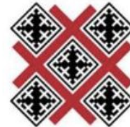
Hook Tus Khawb