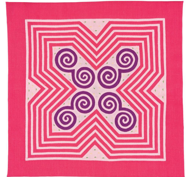
Xab Lee's paj ntaub, 1988