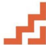
Rickrack Steps Tus Ntaiv