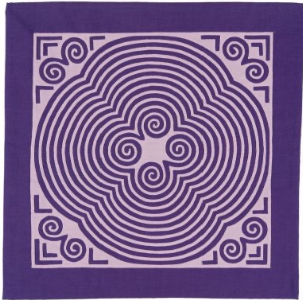
Mao Yang's, paj ntaub table cover