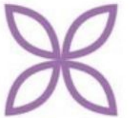
Rice Seeds Noob Nplej