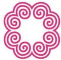
Elephant Foot Print Ko Taw Nixhw

Hmong symbol images from: Hmong Embroidery.org